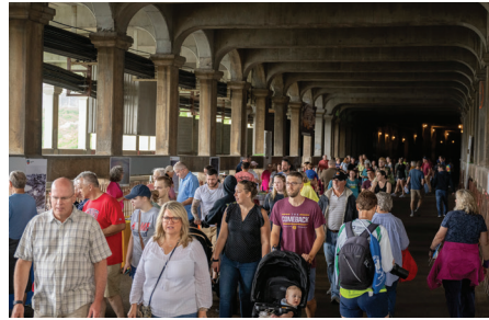
Veterans Memorial Bridge