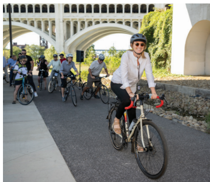
Towpath Trail at Canal Basin Park