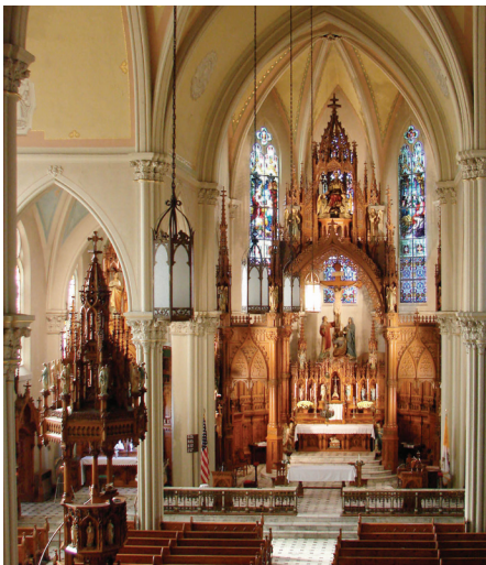
St. Stephen's Catholic Church

See Sunday, June 23 on page 5 for details.