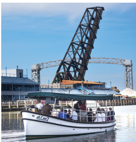
Cuyahoga River boat ride aboard the eLcee2