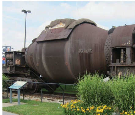
Steel Heritage Center