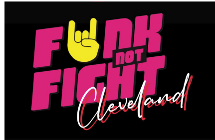
Funk Not Fight Love Fest