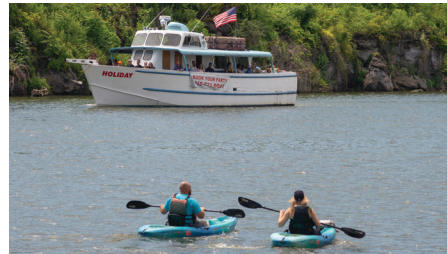
Kayaking at Cuyahoga River Rally