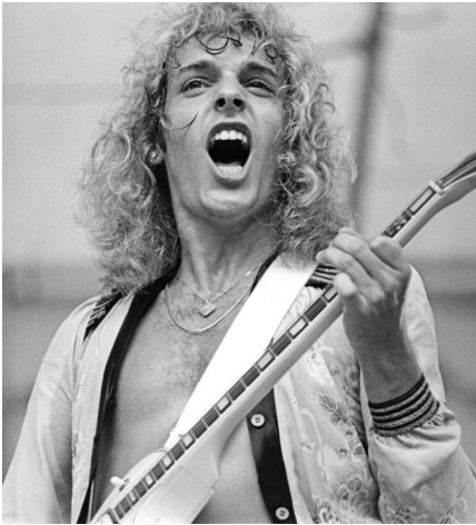
Peter Frampton at the 1977 World Series of Rock