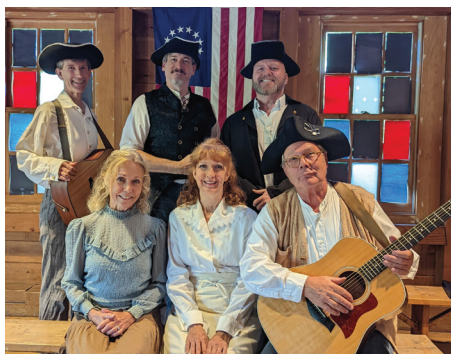
The Lantern Theatre