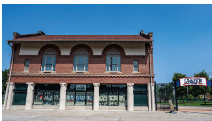
Baseball Heritage Museum at League Park